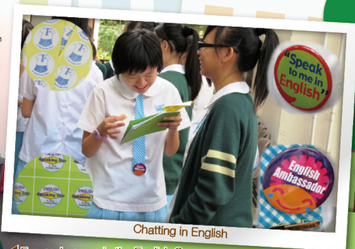
Chatting in English