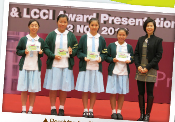
▲ Receiving the Champion Award

I am really thankful to my teachers who introduced me to this competition. I had never written a script or recorded my voice for a radio show before, but the one thing which helped me solve all my problems was teamwork. This was really important since I had to work closely with my teammates. The competition also helped boost my confidence in speaking English. Recording and listening to myself speaking in English helped me to improve on my weaknesses. This was an amazing experience, and I am really grateful that we won the champion award. Many thanks to the teachers and schoolmates who gave us endless support.