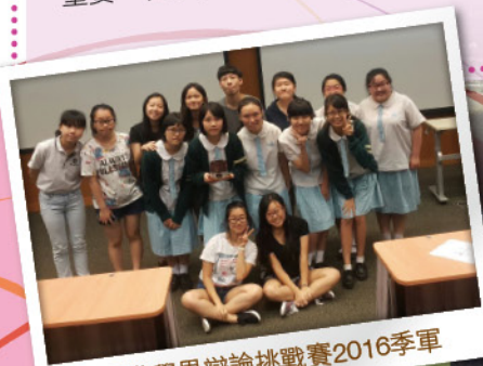
香港學界辯論挑戰賽2016季軍